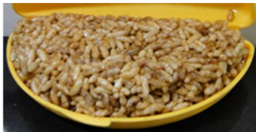
Nutritionally enriched puffed rice cake