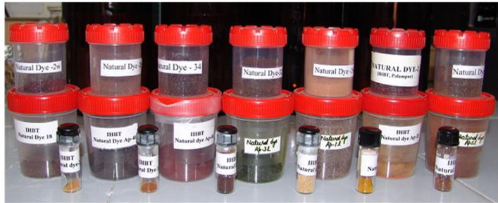
Colors of isolated dyes in water/alcohol