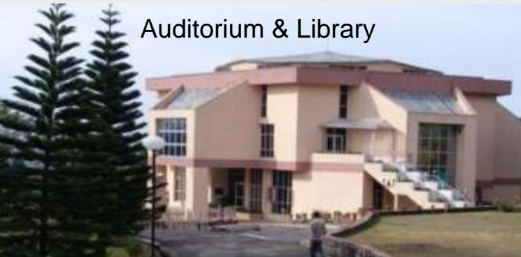
Auditorium & Library

Ultimate Destination for Research on Bioresources